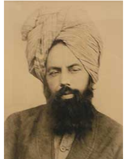
Mirza Ghulam Ahmad (1835-1908)

The Qadianis have strong ties with Israel. Israel has opened centres and schools for them, and helped them to publish a magazine which is their mouthpiece, to print books and publications for distribution worldwide.